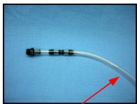
Simulated Dema Injector barb

Then, slip the 1/4inch product intake tubing over the Inner Tubing and onto the barbed fitting on the Dema Injector Barb.